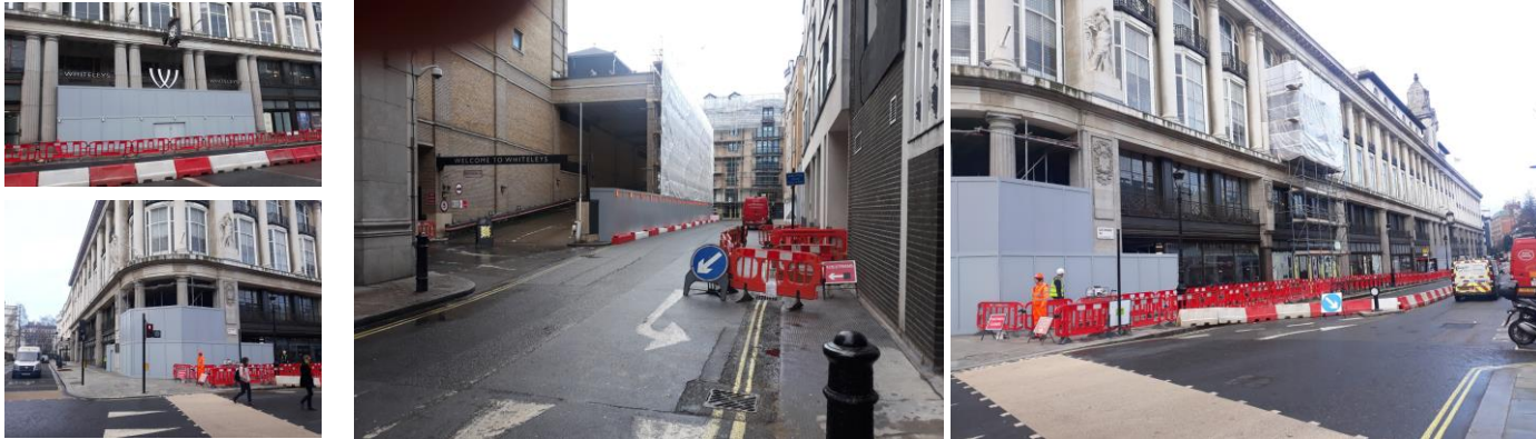
Above pictures show: Double height hoarded main entrances, hoarding in Redan Place and Queensway closures